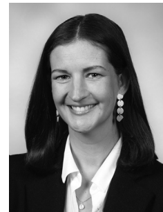
Ellen Sandell Melbourne