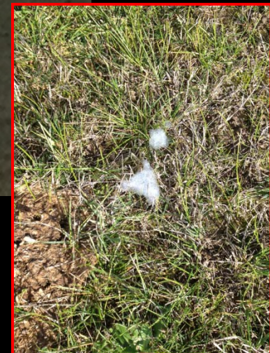
Slide 10 Foam landing on private property