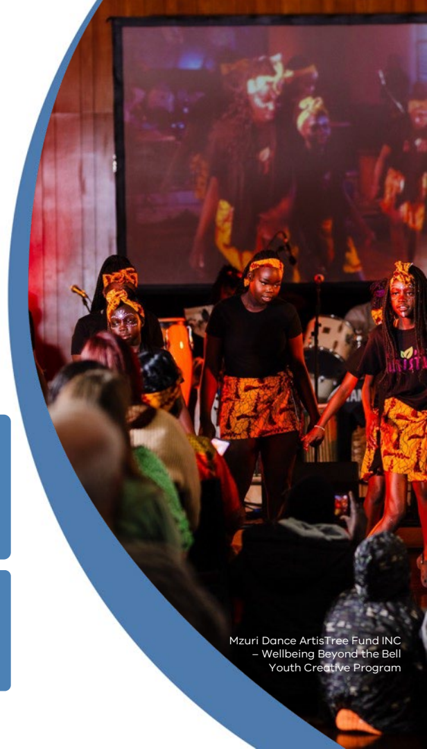
Mzuri Dance ArtisTree Fund INC – Wellbeing Beyond the Bell Youth Creative Program

reduction in seriousness of offending shown for those who completed the Program