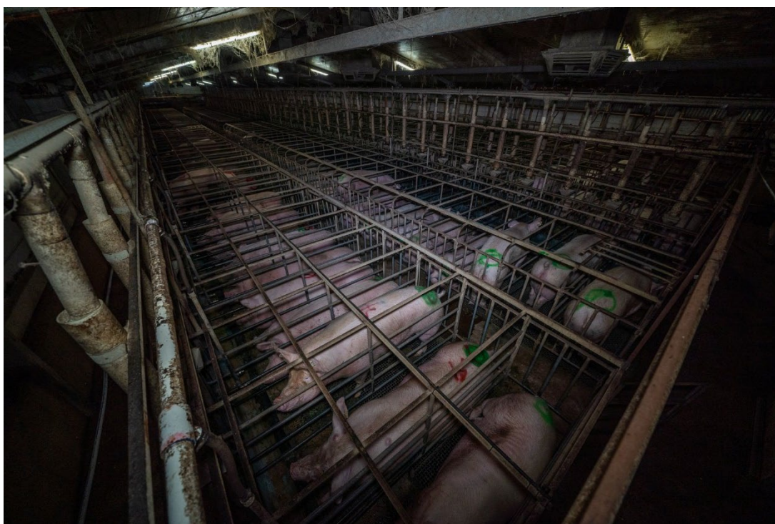
Sows in sow stalls at Midland Bacon piggery, Victoria, 2022.

Sow stalls are small cages, typically measuring 0.6m wide by 2.2m long, in which pregnant sows are confined during their pregnancy. The pig farming industry has long boasted about its voluntary phase-out of sow stalls, which was to be completed by 2017.