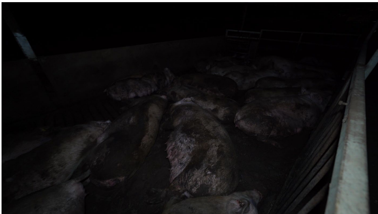
Sows confined in a 'group housing' pen in a Victorian piggery, 2023.

Group sow housing is the industry's alternative to sow stalls. Instead of confining pregnant sows to individual cages, they are packed together in concrete or metal pens and forced to live where they urinate and defecate, for up to the entire 4-month duration of their pregnancy. Without any sort of stimulation, sows become aggressive and frequently fight with each other.