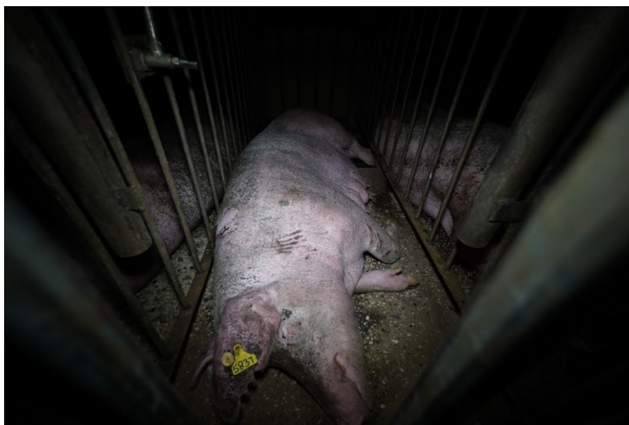
Sow in a mating stall in a piggery in northern Victoria, 2021.

Mating stalls are de facto sow stalls – small cages into which sows are moved immediately after their piglets are weaned, for the purposes of being artificially inseminated. The main physical difference is that the back of a mating stall has a small gate to allow a worker to easily inseminate the sow from behind. They are otherwise no different to sow stalls, measuring a minimum of 0.6m wide by 2.2m long and allowing continuous confinement of sows for up to six weeks . While the industry claims to only keep sows in these cages for up to five days at a time (which is still a very long time to be confined to a cage and unable to turn around), this is not monitored or enforced. The only thing preventing farmers from keeping sows in mating stalls for longer than five days is their scarcity – farms tend to have far fewer mating stalls than pregnant pigs.