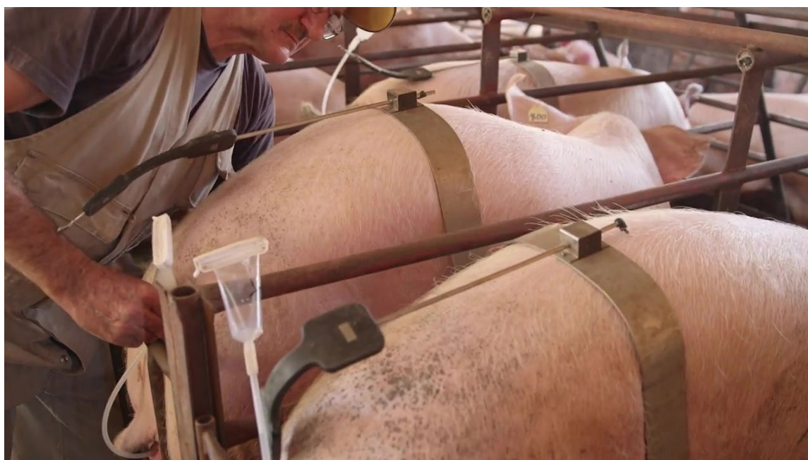
A worker artificially inseminating sows using a tube of boar semen attached to a ‘pork stork’.

A tube containing boar semen is then attached to the end of a catheter, referred to by the industry as a ‘pork stork’, which is inserted into the sow’s vagina.