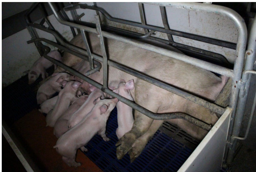
Sow and her piglets in a farrowing crate, Wondaphil Pork Company, Tragowel VIC.

Farrowing crates are small pens containing a cage slightly smaller than a sow stall (0.5m wide by 2.2m long). Sows are moved into these cages one week before they are due to give birth, and remain there for up to 6 weeks in total, nursing their piglets who can move around the pen and in and out of their mother's cage. This 6 week limit is not enforced or monitored; the only thing preventing farmers from keeping sows in farrowing crates for longer is the need to get new due-to-farrow sows into them and to reimpregnate sows as quickly as possible.