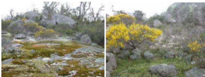
Mt Cooke monadnock before the 2003 wildfire. A 'refuge' for fire sensitive and fire intolerant species and communities such as Acacia ephedroides (yellow flowers), moss swards (foreground left photo) and Borya meadows (foreground right photo).

Granite rock outcrops are the remains of an ancient land surface that was thought to have been stripped away some time between the Middle Jurassic and the early Eocene, some 60 million to 150 million years ago. These outcrops are of immense biological importance because they are often 'islands' that comprise a small proportion of the entire landscape, so are uncommon and unusual compared with other landforms. Consequently biotic assemblages on rock outcrops are also uncommon and unusual landscape elements. Rock outcrops in the south-west forest region display high levels of plant endemism and species assemblages that contrast with the surrounding landscape as a result of strong environmental gradients, particularly associated with substrate and moisture regime. A significant proportion (~11 per cent) of all Declared Rare Flora in the south-west region occurs on or around rock outcrops.