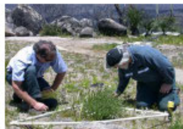
Herbs and shrubs regenerated from seed or by resprouting and will recover relatively quickly.