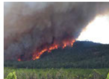
The 2003 wildfire – based on extent of bee death, probably the most intense fire on Mt Cooke in ~250 years.

The unusual rock outcrop environment gives rise to a fire environment that is also unusual compared with the surrounding forests. In forests, live and dead vegetation, or fuel, is more-or-less continuous and can reach heavy loads if unburnt for long periods. On rock outcrops, vegetation is usually fragmented, often sparse and does not reach the same high fuel loading as surrounding forests. Because of the nature of the fuels, rock outcrops are less flammable and it is not surprising to find assemblages of plants that are either 'fire sensitive' (readily killed by fire but will readily regenerate from seed) or 'fire intolerant' (harmed by fire, which appears to play no beneficial role). Acacia ephedroides and Calothamnus rupestris are examples of fire sensitive plants while moss rock swards and Borya meadows are examples of fire intolerant communities.