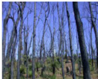
Forest and woodland trees on and around rock outcrops take many decades to recover following an intense wildfire.