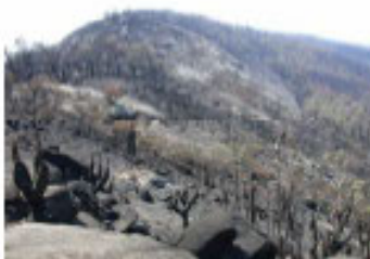
All vegetation on the outcrop was burnt or charred by wildfire – there were no 'refuges'.