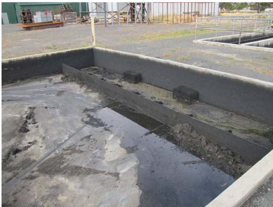
Figure 4-7 Grease interceptor cell