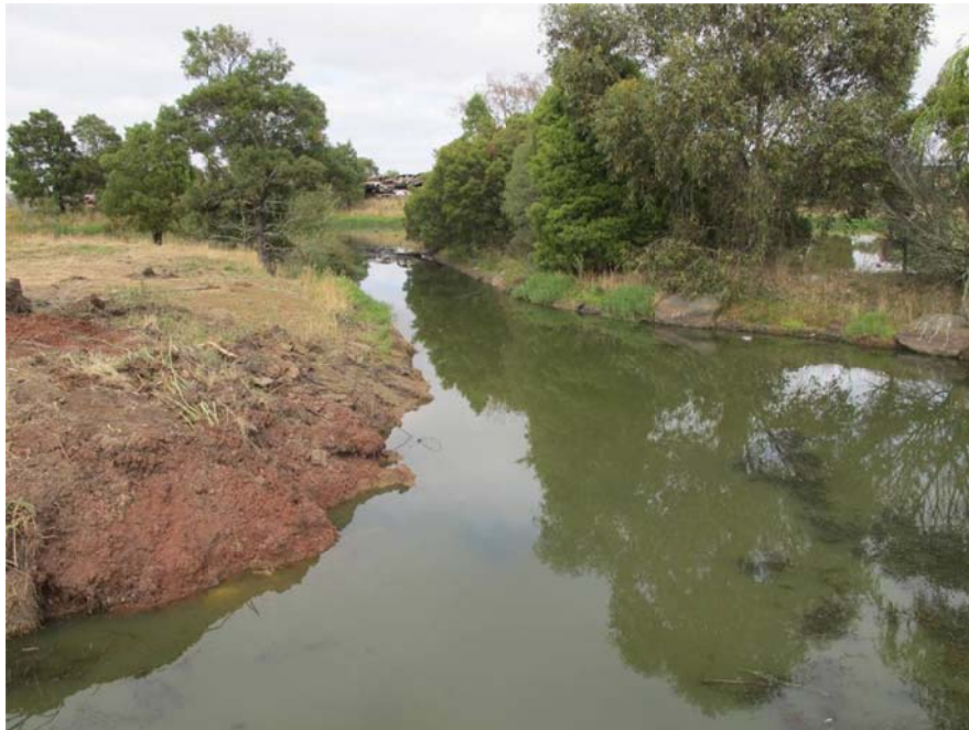
Figure 4-9 Dam 2 near pump station

The overflow from Dam 1 gravity feeds into Dam 2 which consists of a series of bends and an island. The water is extracted from Dam 2 (Figure 4-9) and pumped into the holding cell for fire fighting activities.