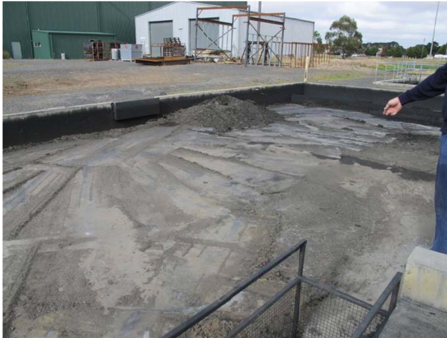
Figure 4-6 Dried and piled settled waste