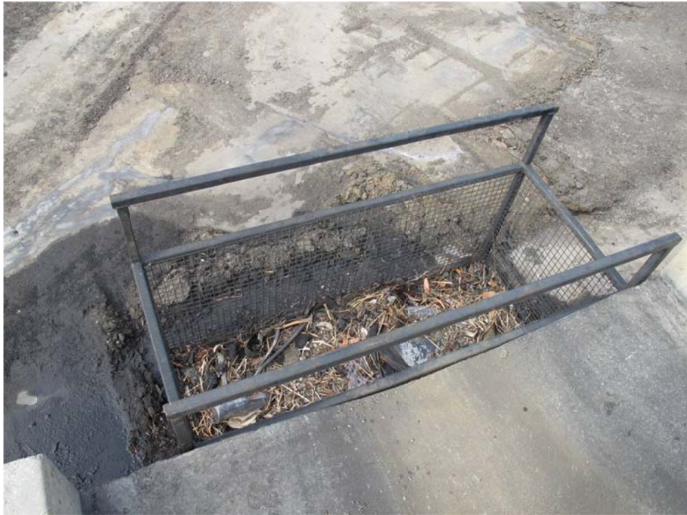
Figure 4-5 Coarse filter basket

The immediate runoff from the training site passes through a coarse filter basket (Figure 4-5).