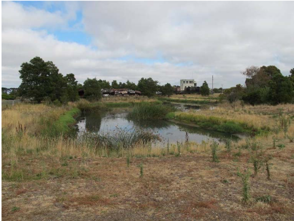
Figure 4-10 Dam 3 entry point

The overflow from Dam 2 enters a small drain which runs into Dam 3 (see Figure 4-10).