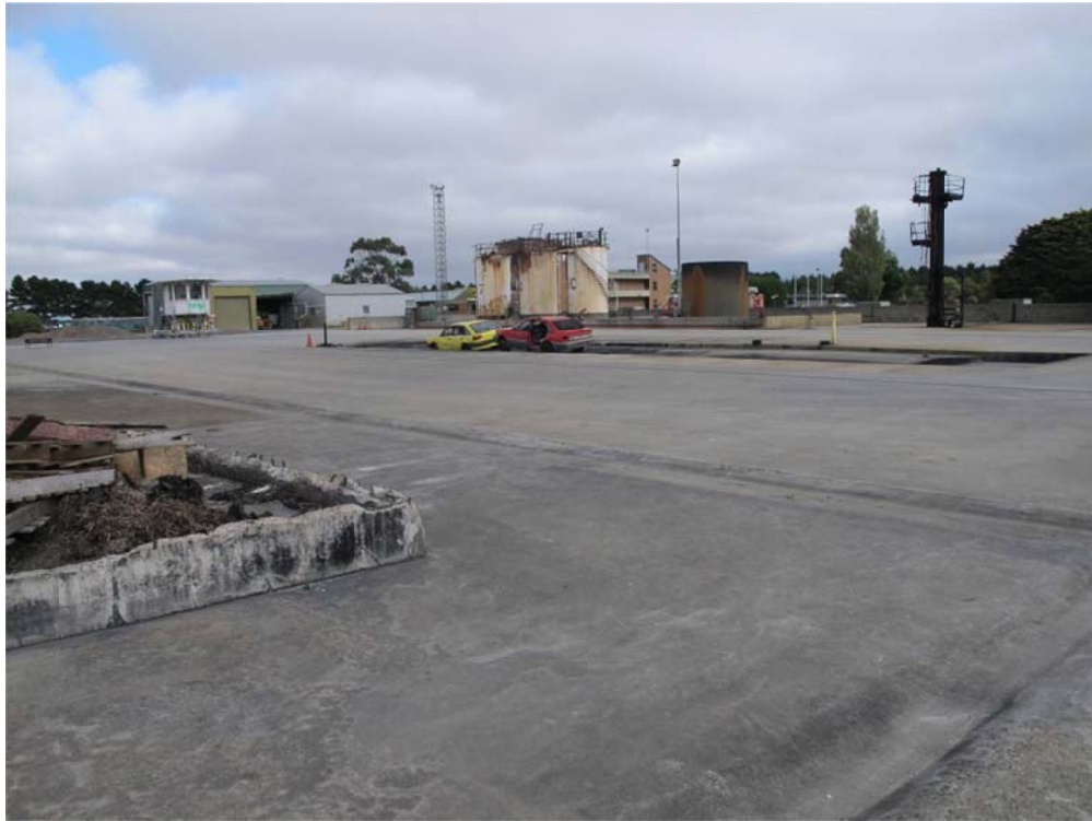
Figure 4-2 Main fire training area