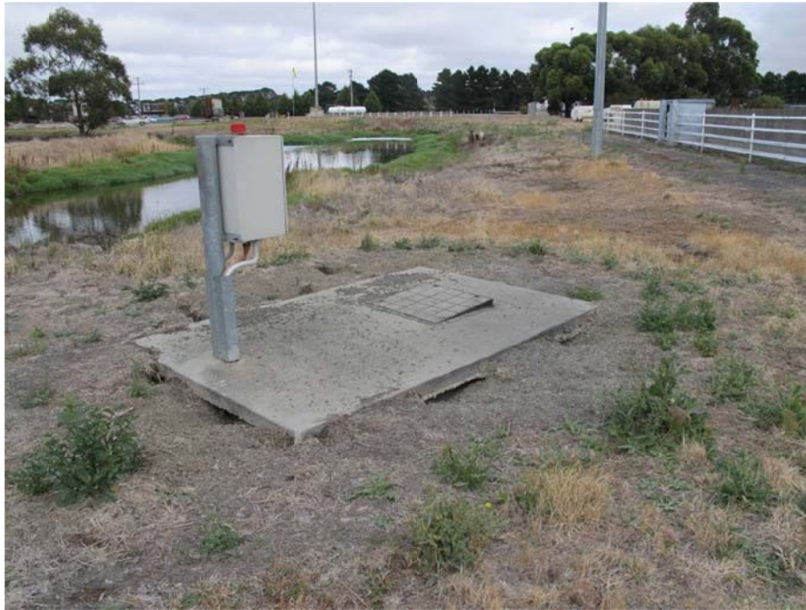
Figure 4-8 Dam 1 and pump station

The final effluent from the triple interceptor system enters Dam 1 (Figure 4-8) via a pump system. At the time of the visit an aerator was operating in Dam 1.