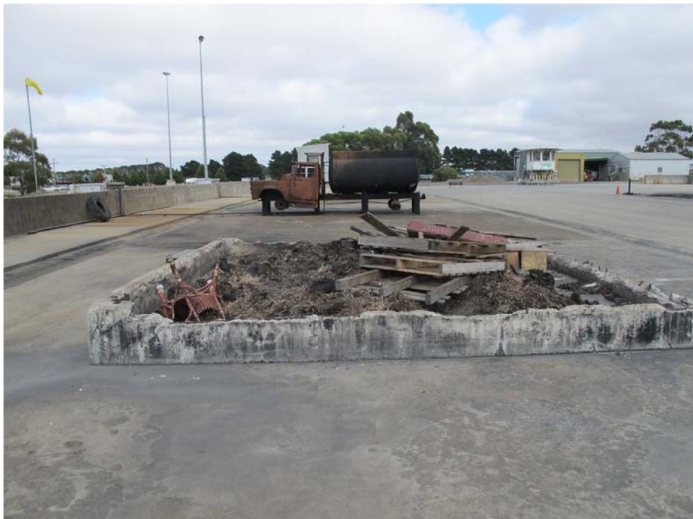
Figure 4-1 Raw materials

The Fiskville site uses gas, unleaded petrol or diesel to activate and/or fuel their fires. The CFA runs a variety of training exercises which include the burning of old cars, wood, hay, straw, plastic, wooden pallets (see Figure 4-1).