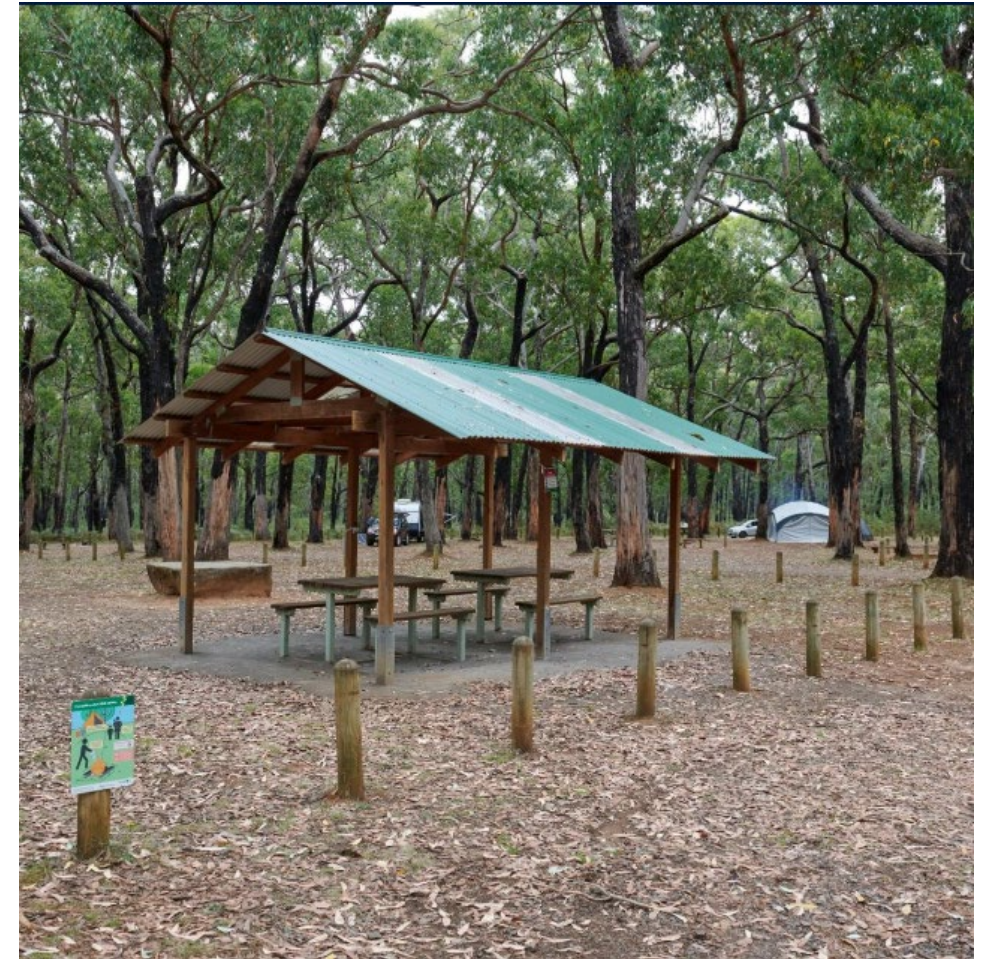
Sawpit Campground in Mount Clay State Forest