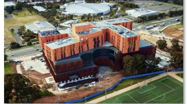
Complete: Wonthaggi Hospital expansion (Stage 1)