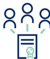
3. Support the change by developing a professional learning strategy