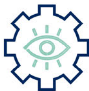
5. Sustain and commit to the change by having a long-term vision, approach and funding