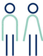
1. Address the drivers of gender-based violence

As part of a comprehensive approach and knowledge building about gender-based violence, it is helpful to understand why this work is important and what evidence tells us about best practice and effective approaches. A recent review 6 of international and national evidence on respectful relationships education outlines that policy and program design must include seven core elements to be effective as a strategy to prevent gender-based violence: