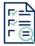
7. Evaluate for continuous improvement