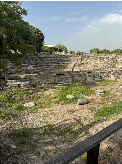
Pictured: Walls of Troy.