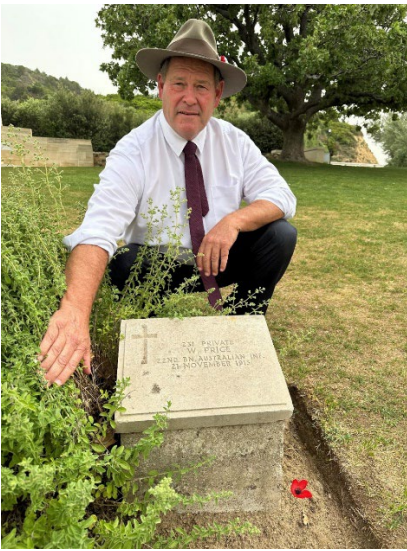
W price from Peechelba buried in Ari Burnu