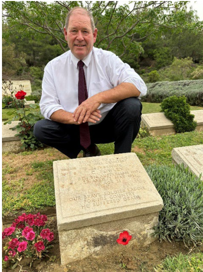
C Powley from Boweya buried no. 2 outpost cemetery