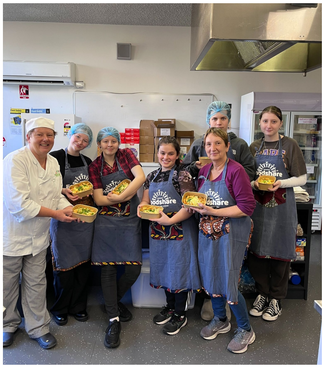
Cooking: We teach school and community groups how to cook. 1112 participants, 13% increase this year