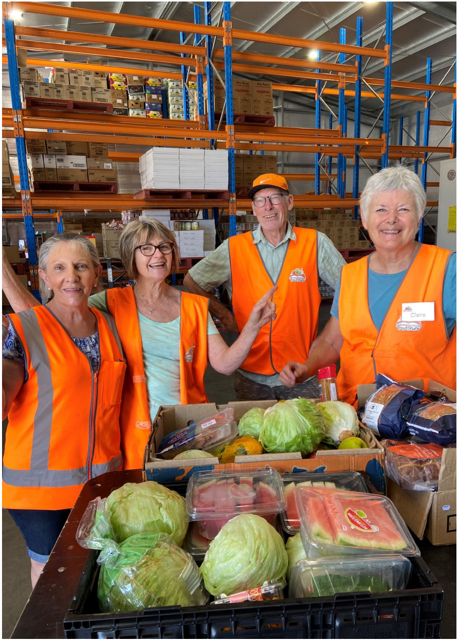
Engaging: Over 1000 active volunteers across Victoria, a 19% increase in the last year.