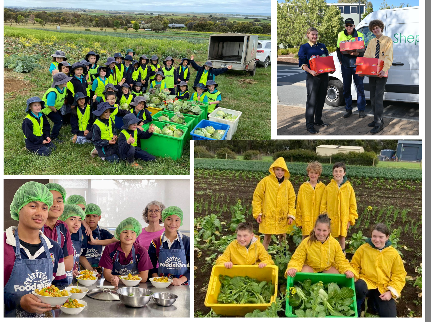
Teaching students learn to grow, cook and share food