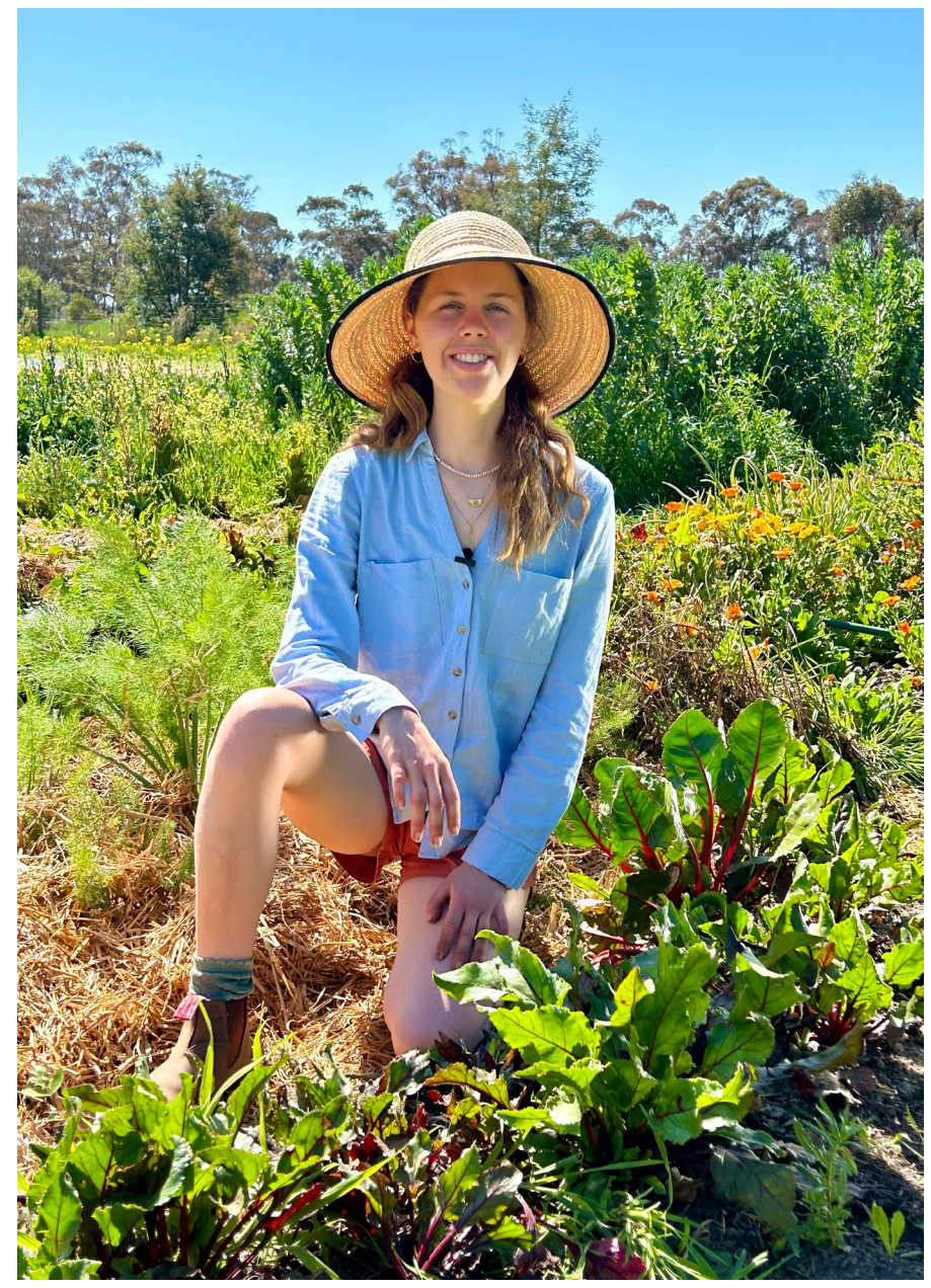
Growing fresh food and teaching food growing skills. Donated farmland, donated seedlings