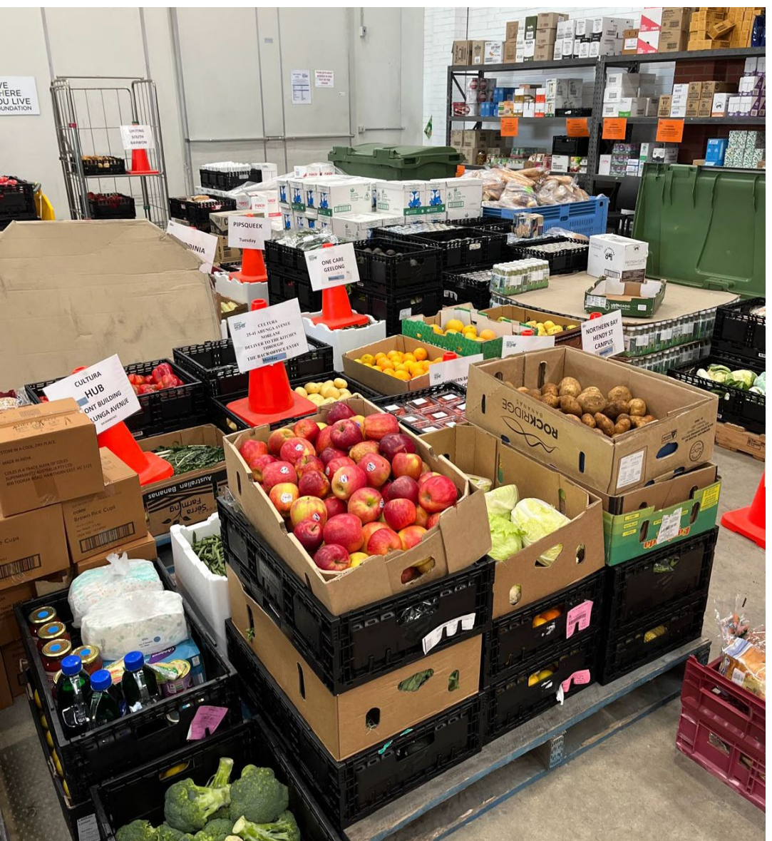
Sharing: Volunteers rescue and store food in our 6 warehouses. 40% increase in demand. 25% increase in food sourced.