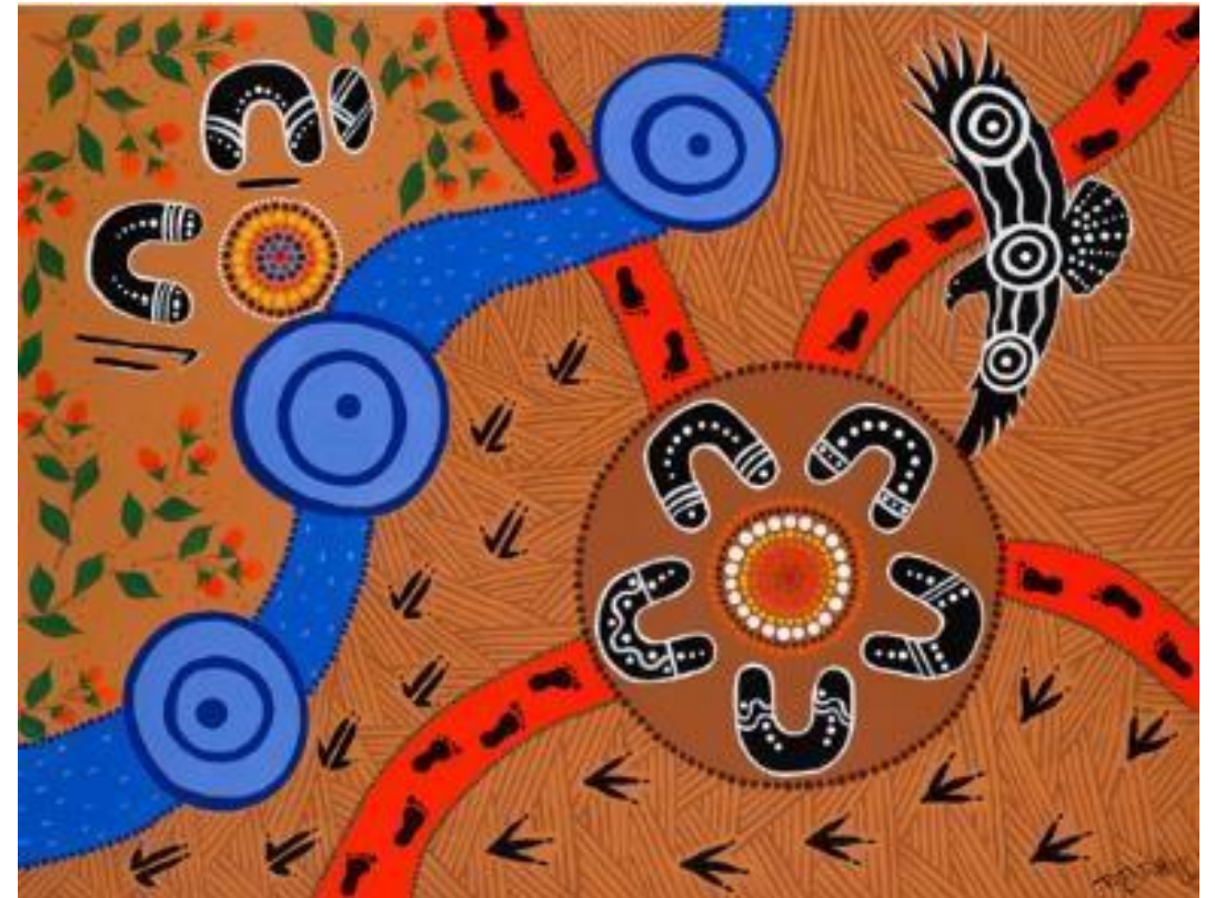
'Origin: Victoria, Australia (2021)'