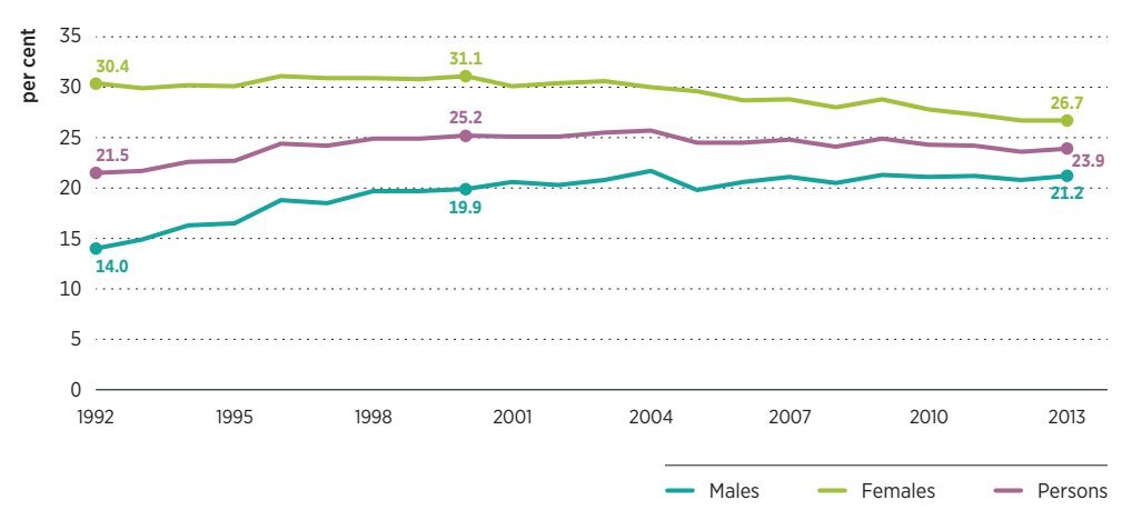
Figure 1.2 Percentage of employees in casual work, Australia, 1992–2013