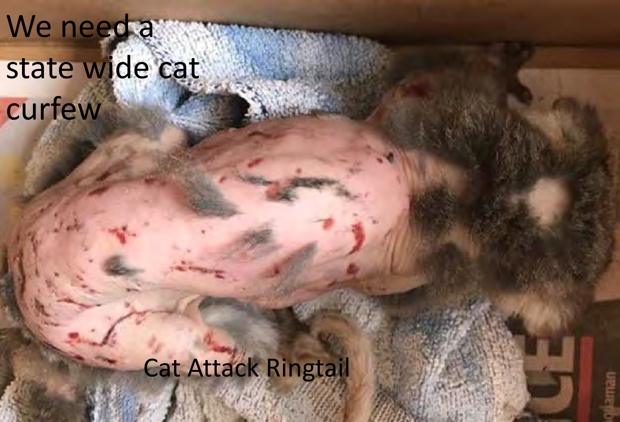
Cat Attack Ringtail