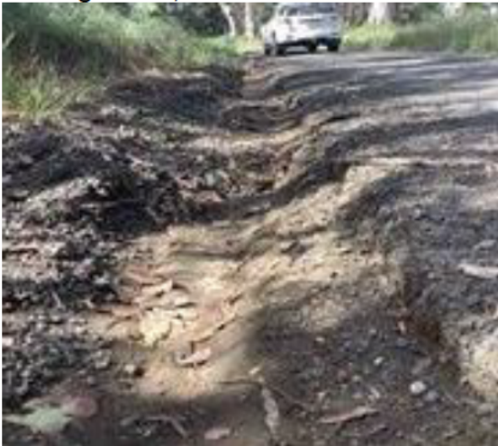
Tarcombe Rd, Avenel