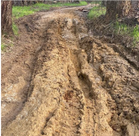
Chapmans Rd, Boho South