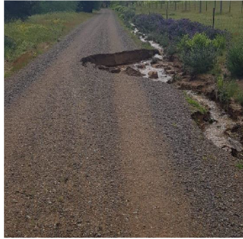
Mt Bernard Lane, Avenel