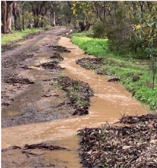
Pontings Lane, Bailieston