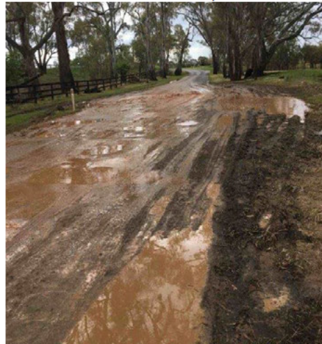
Mitchellstown Rd, Mitchellstown