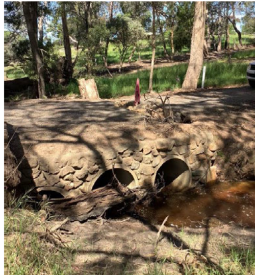
Kelvin View School Rd, Kelvin View