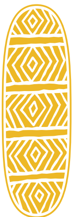
Brataualung people in South Gippsland.

We have a strong and living culture, a stable and growing corporation, and our rights to Country and the natural resources it contains, have been legally recognised. We have built the foundations to heal wounds from the past and rebuild our heritage, culture and people. We are in a strong position to move forward to build a better future for our community.