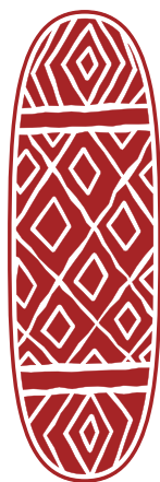
Krauatungalung people near the Snowy River.