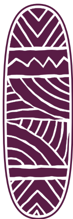
Brabralung people are from Central Gippsland.