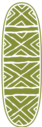
Brayakaulung around the current area of Sale.