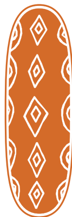
Tatungalung near Lakes Entrance on the coast.