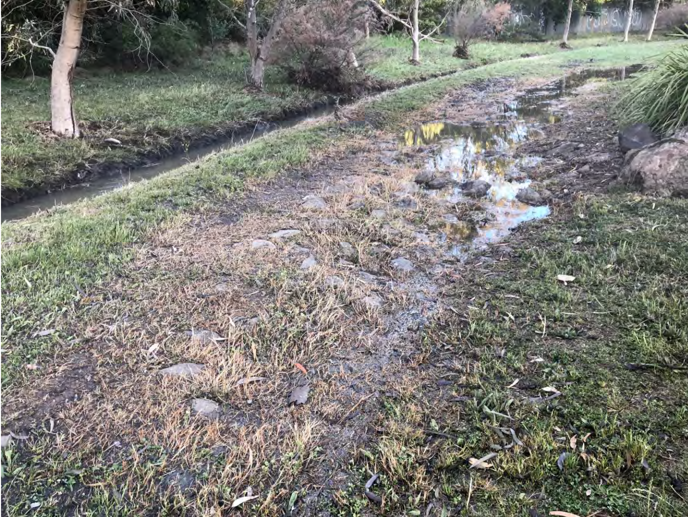
Cup Day, 6 November 2018, 2 months after the fire - Park Avenue, West Footscray