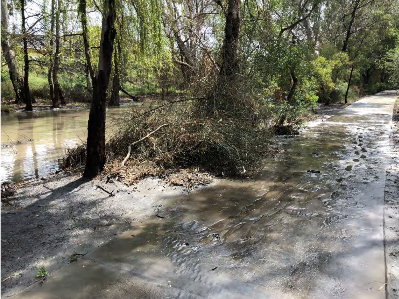
Cup Day, 6 November 2018, 2 months after the fire - Cala Street, West Footscray