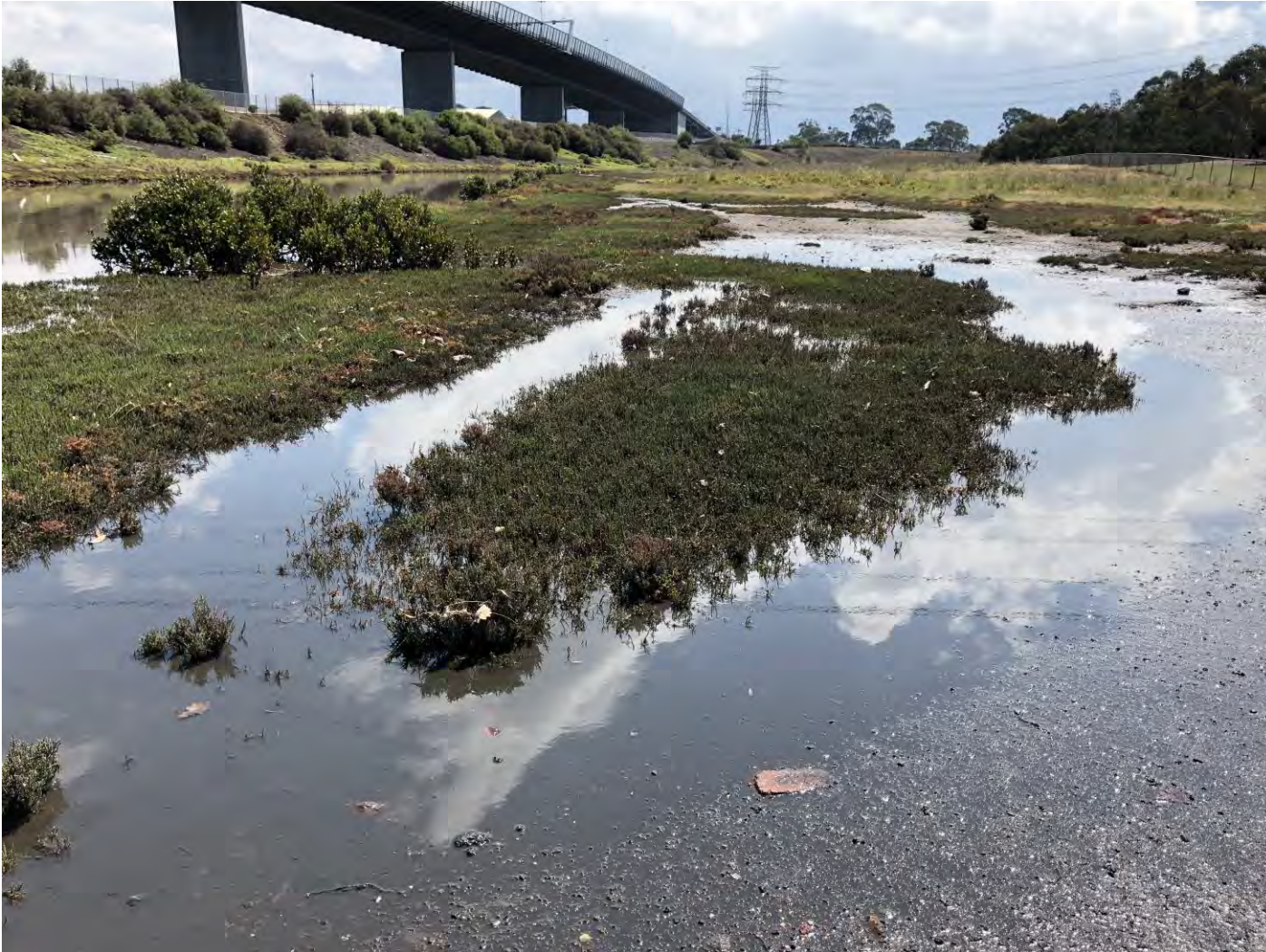
Cup Day, 6 November 2018, 2 months after the fire -Hyde St Reserve, Yarraville