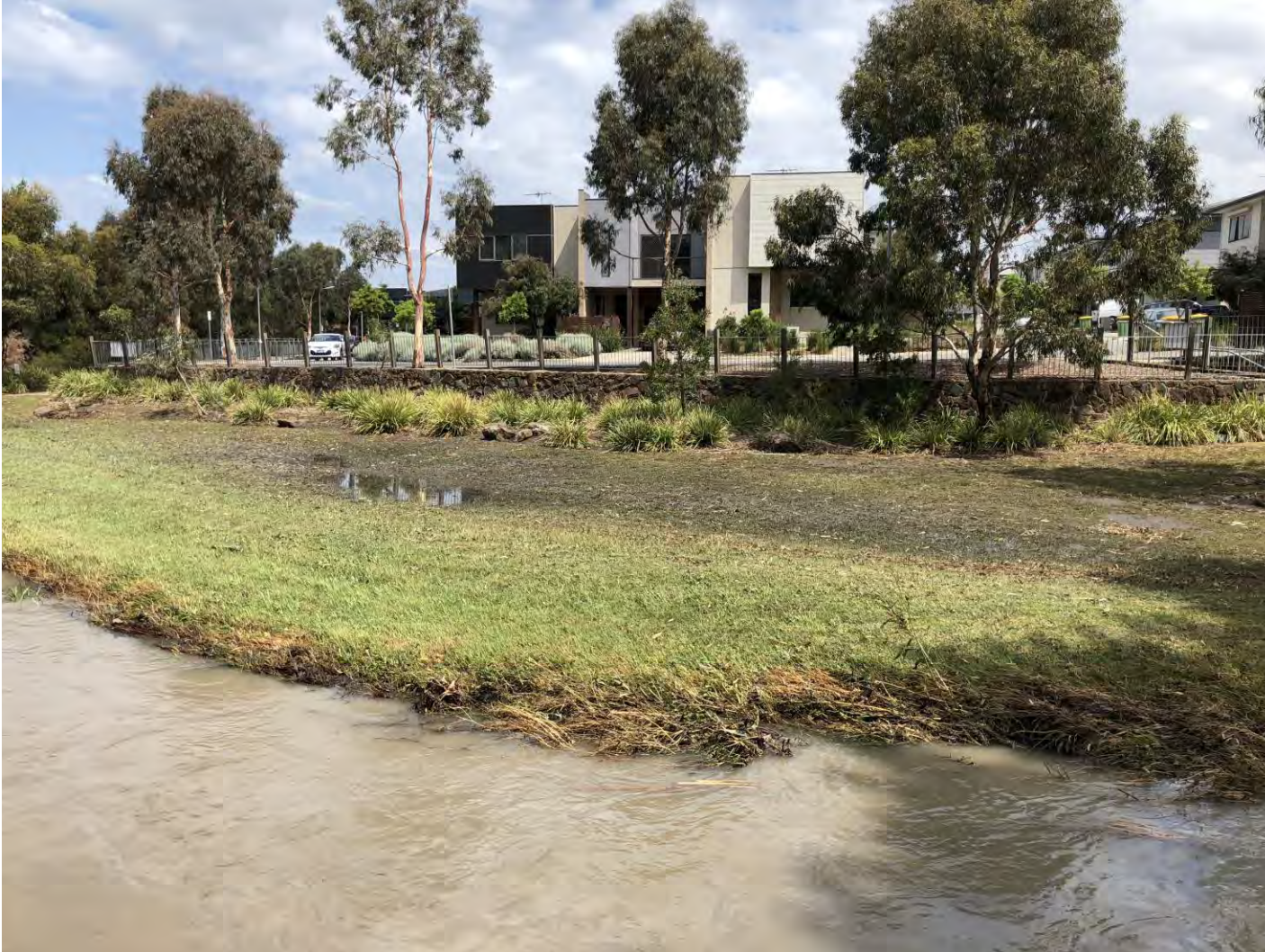
Cup Day, 6 November 2018, 2 months after the fire - Park Avenue, West Footscray