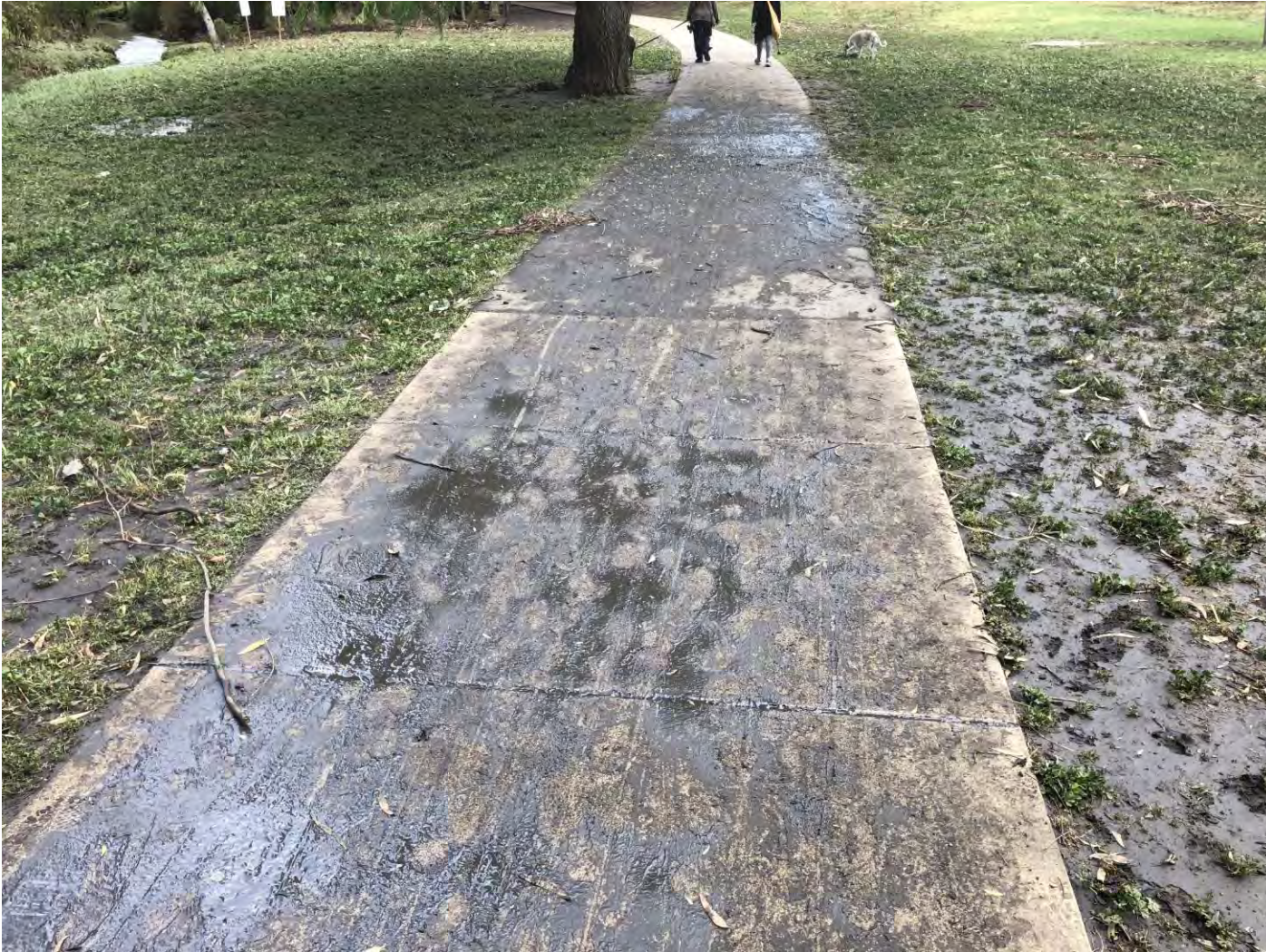
Cup Day, 6 November 2018, 2 months after the fire -Cruickshank Park, Yarraville