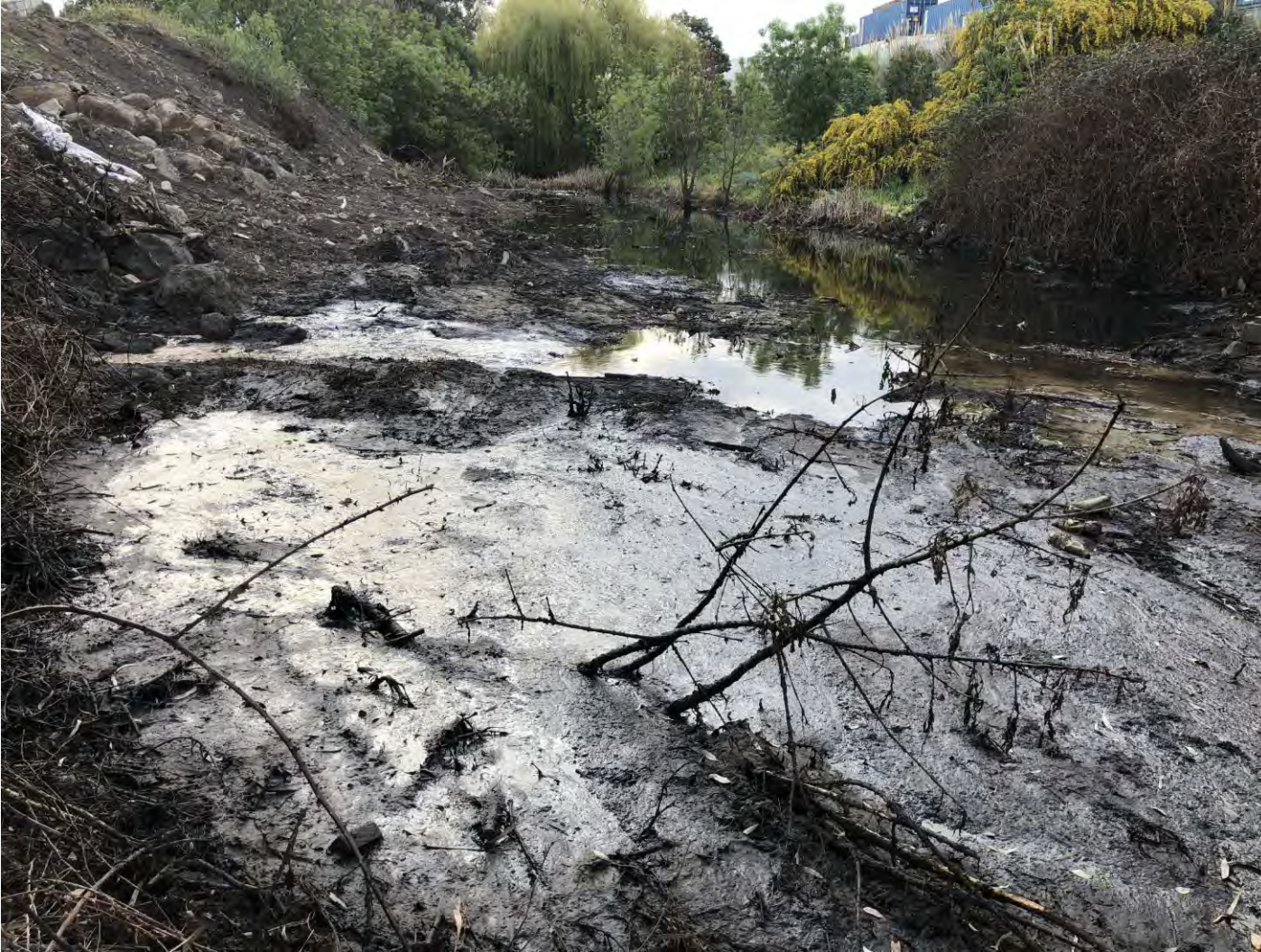
Near the fire site, October 2018, approx. 6 week after event