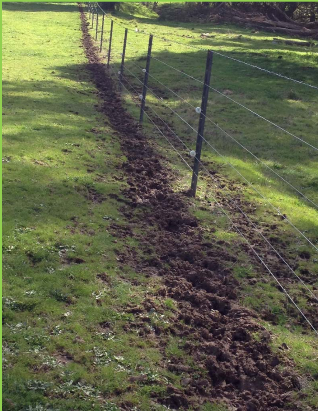
Deer highway on the inside of a boundary fence! No stock in this paddock for 6 weeks.