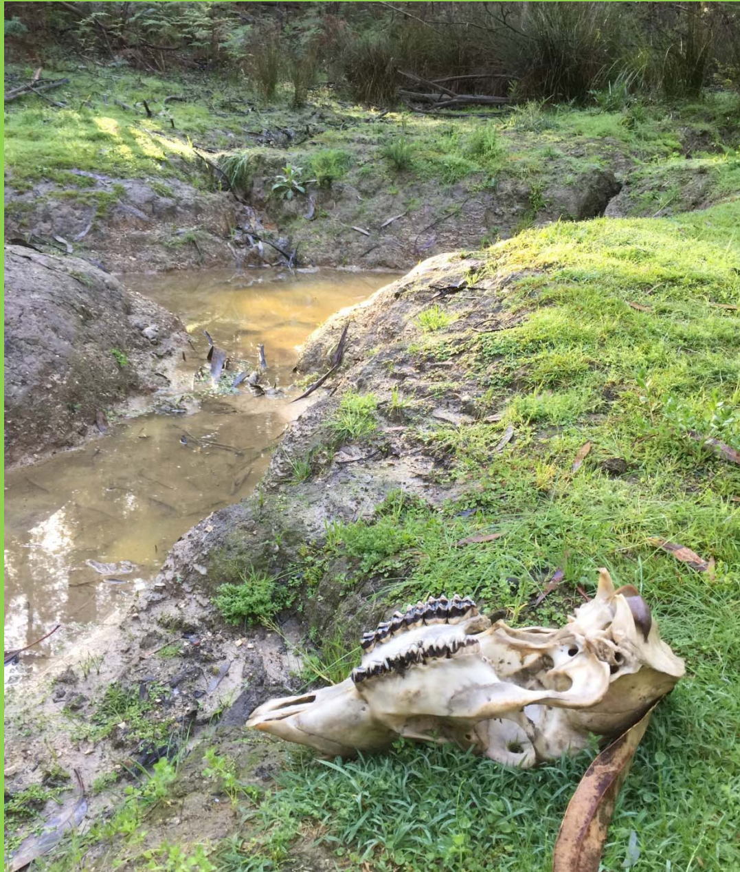
Deer wallow in water waterway. This deer was shot in the wallow six weeks ago and left.