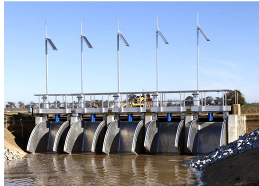
Children attending the Right Water house at the Melbourne International Flower and Garden Show, 2014. Flume gates as part of the GMW Connections project in the Goulburn Murray Irrigation District