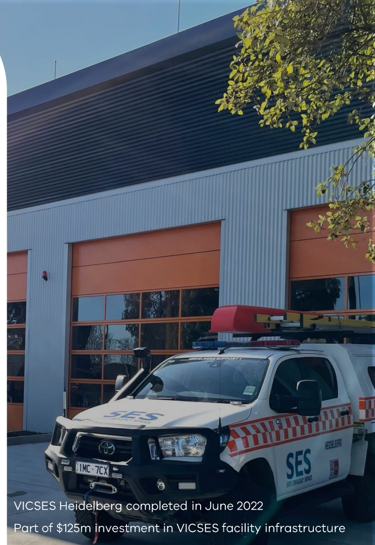
VICESSES Heidelberg completed in June 2022