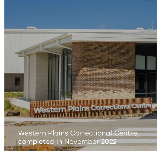
Western Plains Correctional Centre, completed in November 2022