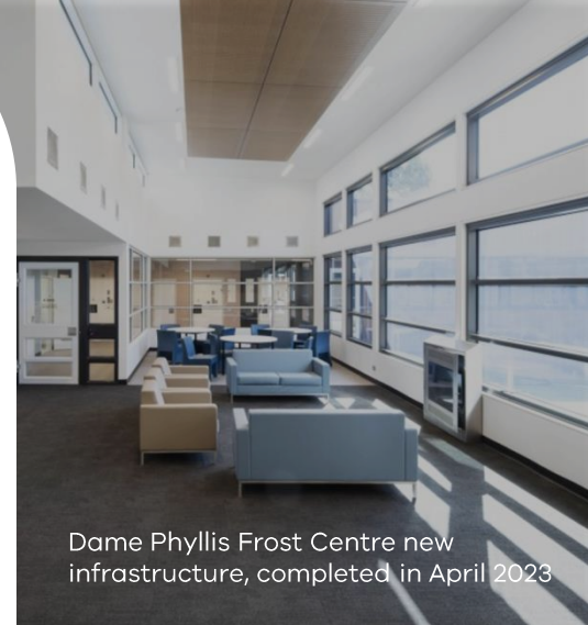
Dame Phyllis Frost Centre new infrastructure, completed in April 2023

$2.1 b Invested in Prison Infrastructure