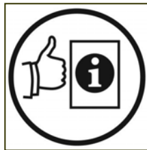
Figure 3.2: Symbol used to represent documents in Easy-English.