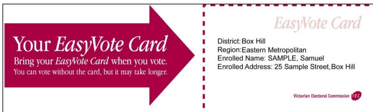
Figure 3.1: Easy Vote Card