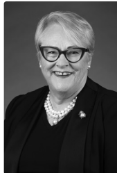
Bev McArthur Western Victoria