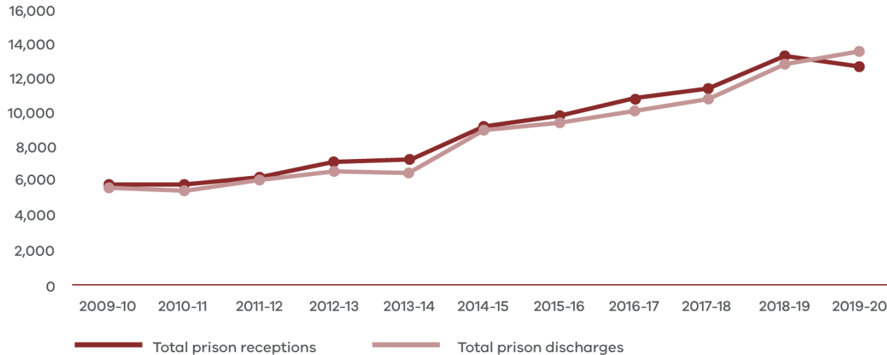
Total prison receptions and discharges trend

Over 2019-20, prison population fell 12% from 8,102 prisoners on 30 June 2019 to 7,151 prisoners on 30 June 2020