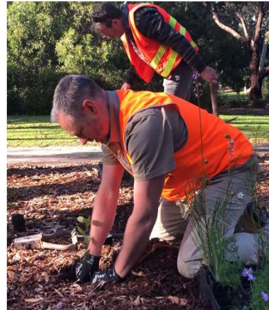
GREENING THE CITY

The City of Melbourne has also worked with the Victorian Government on Working for Victoria initiatives.