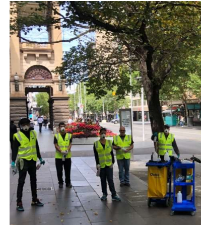
CLEANING THE CITY

Jobs created to plant 150,000 new trees, shrubs and grasses