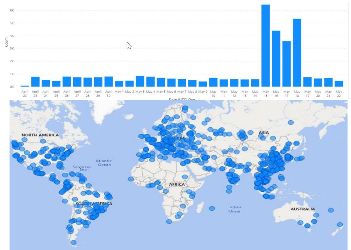
Distributed Brute Force Login Attempts

■ Blocked by rules ■ Phishing ■ Spam ■ Post Delivery Protections (Other)