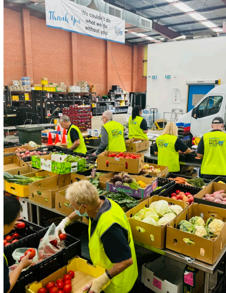
Engaging: Over 1000 active volunteers across Victoria, a 19% increase in the last year.