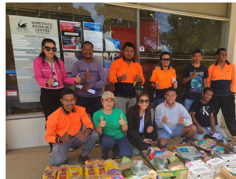
Inclusive and Responsive: Our volunteers, participants and educators come from diverse backgrounds and share diverse cuisines