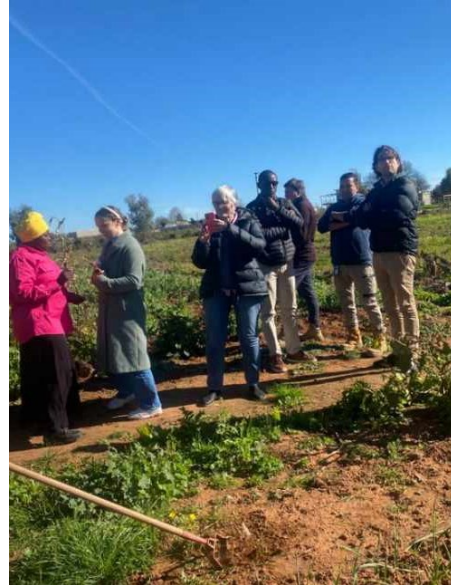
Growing fresh food and teaching food growing skills. Donated farmland, donated seedlings