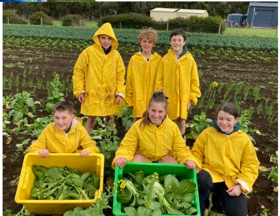
Teaching students learn to grow, cook and share food