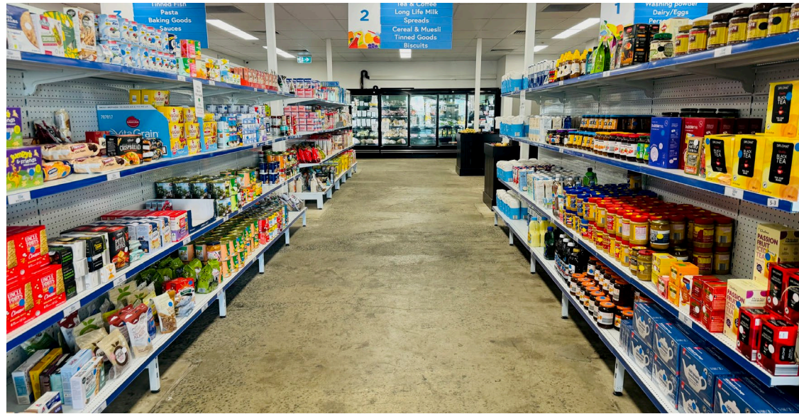
Sharing: Our members run 3 social supermarkets and 3 markets to give access and choice of fresh, healthy food