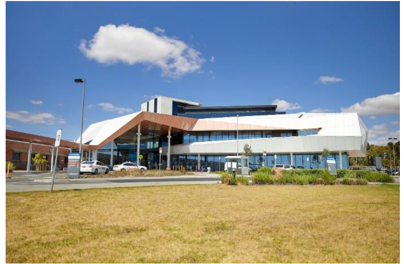
Pictured: Casey Hospital