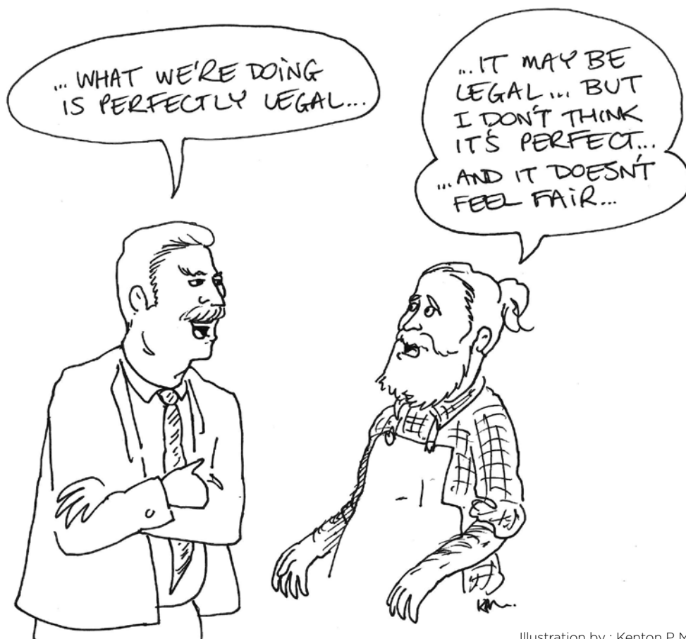
Illustration by : Kenton P Miller

Authorities are encouraged to develop business rules and guidelines that ensure the exercise of discretion reflects the purposes of the law, acknowledge genuine efforts of people to do the right thing, and provide concessions, where appropriate.