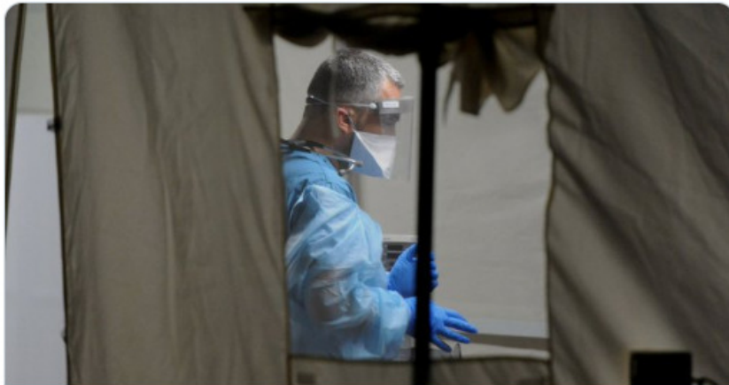
Israeli research center to announce it developed coronavirus vaccine, sources say haaretz.com

I'd rather take my chances with the virus than consume an Israeli vaccine