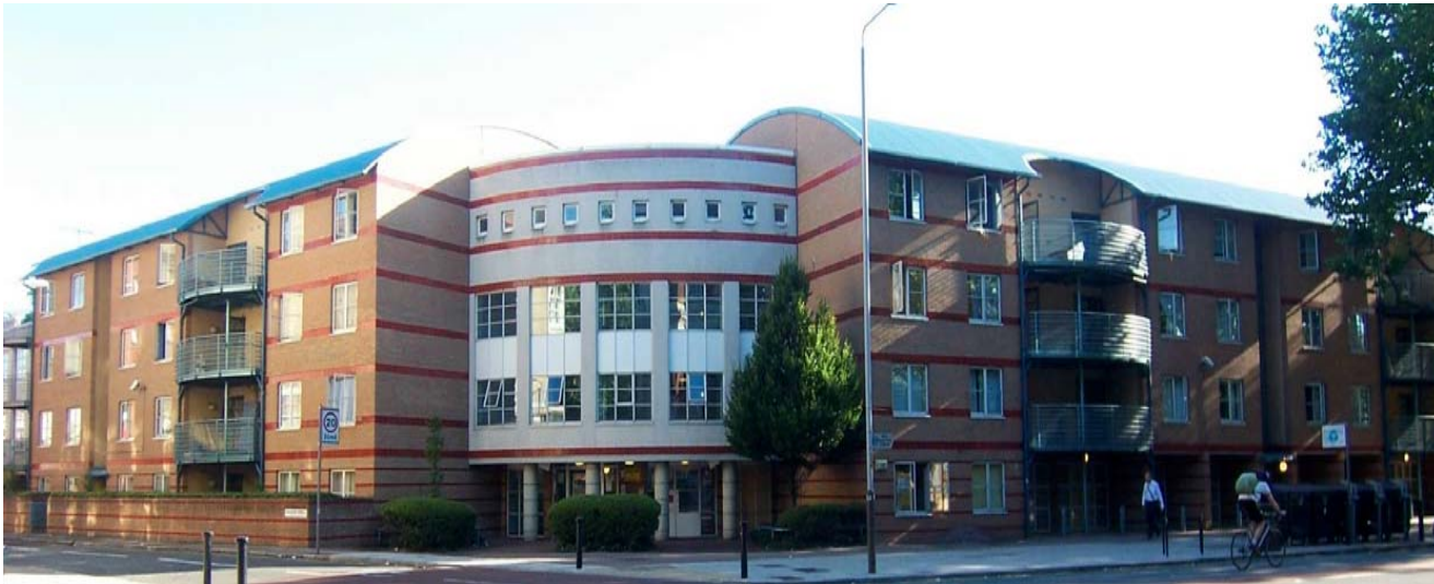
Gateway Foyer, London