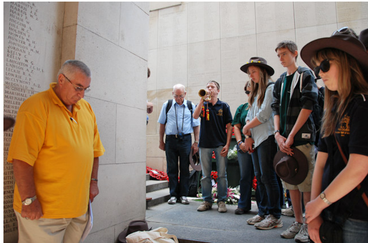
Paying tribute to the ANZACs at Menin Gate, Belgium. Spirit of ANZAC Prize Study Tour, April 2011.