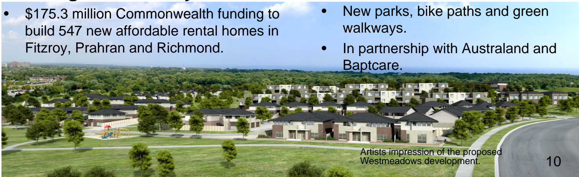
Artists impression of the proposed Westmeadows development.