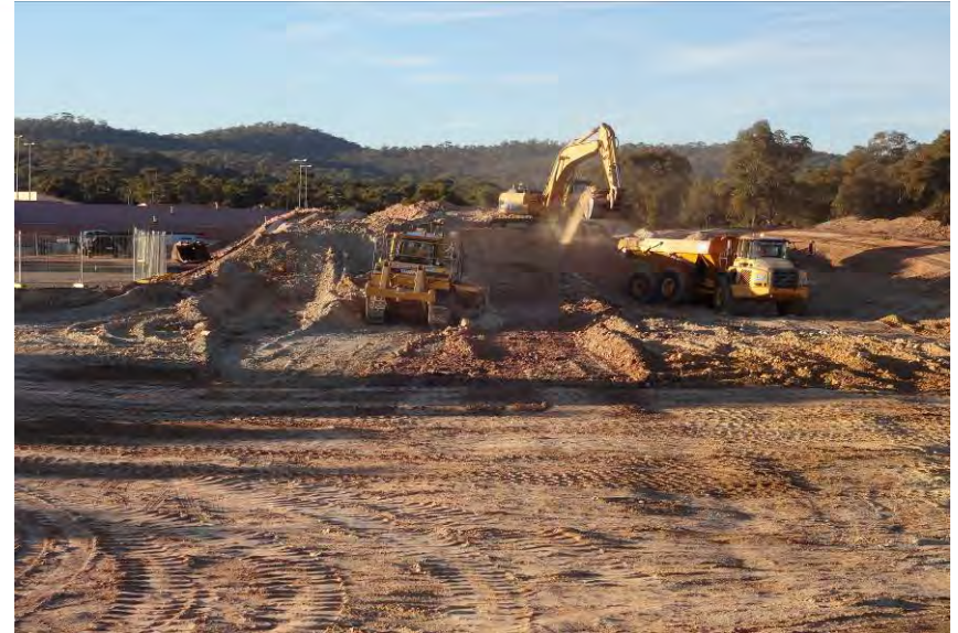
Loddon Prison Expansion