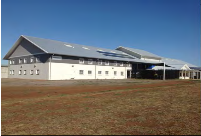
Fishburn Unit – Port Phillip Prison